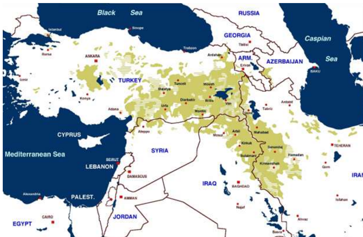
Figure 2: Distribution of Kurds in the Middle East (Kamel, 2018)